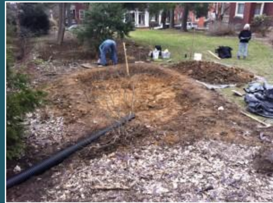
Digging out the rain garden