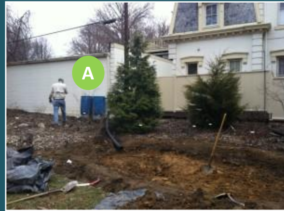
Rain barrels connected to rain garden