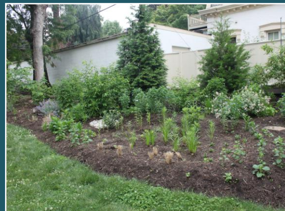
Rain garden two months after planting