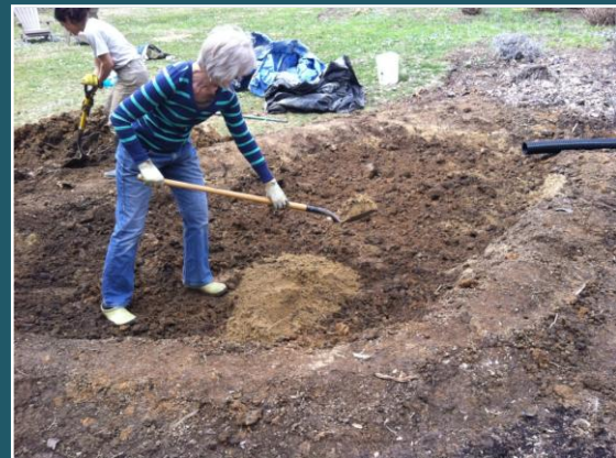
Mixing the soil, sand and compost