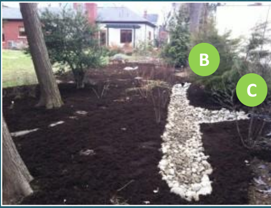
Dry creek capturing rainwater runoff